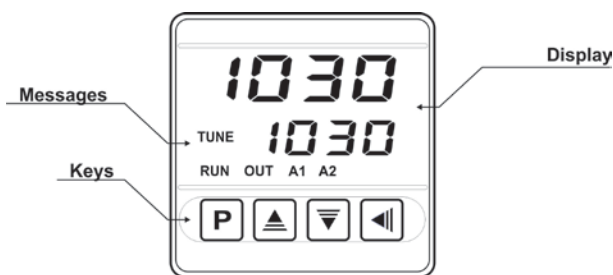
Fig. 02 - Identification of the parts referring to the front panel

The controller's front panel, with its parts, can be seen in the Fig. 02: