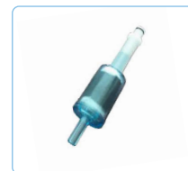
Zero Filter for Calibration (Si-AQ VOC Zero Filter)