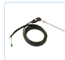
Sampling Probe (Si-AQ Probe with Hose)