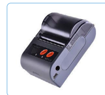
Bluetooth® Printer (Si-AQ Bluetooth® Printer)