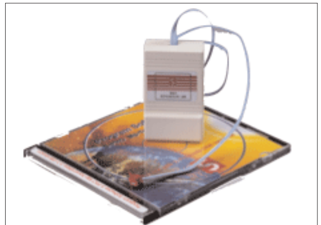
IF700 Programming Interface and PC Based Software