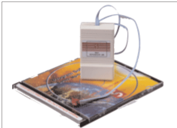
IF700 Programming Interface and PC Based Software