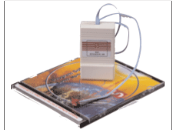
IF700 Programming Interface and PC Based Software