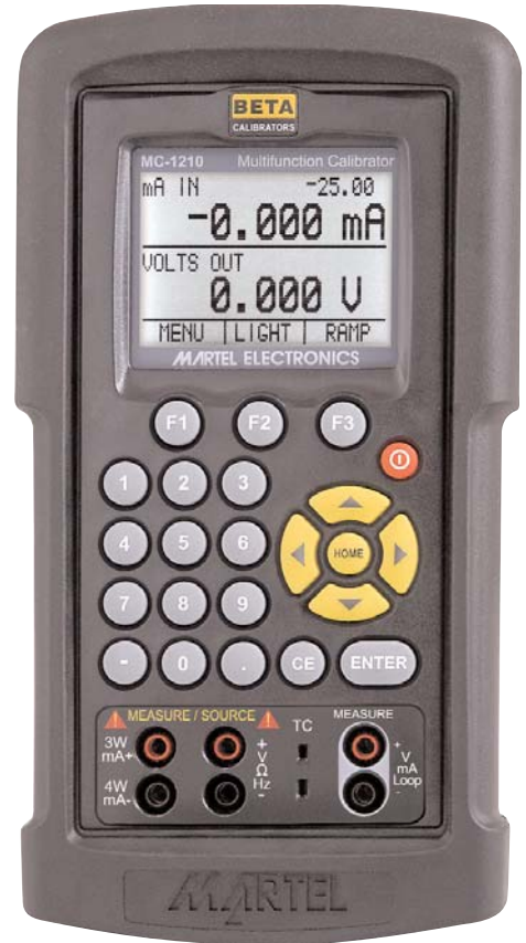
Each instrument includes Instruction Manual, Test Leads, Rubber Boot and NIST Certificate.