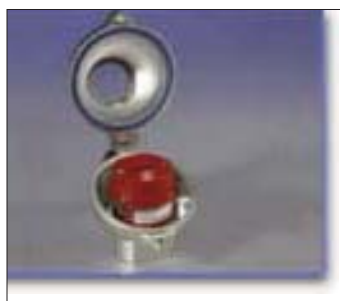
Mp82710 Shown with optional DANW connection head and MP82-Display.