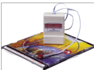
SPI-MP (IF700-USB) Programming interface and PC based Software